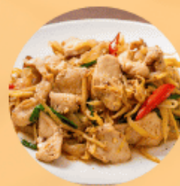
Ginger Stir Fry